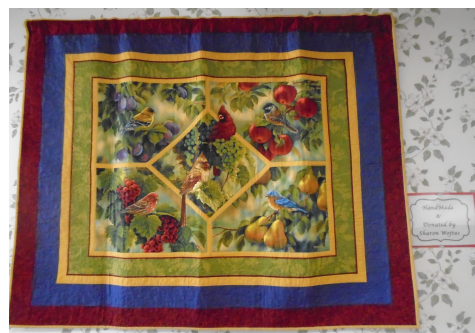
Handmade Quilt of the Month