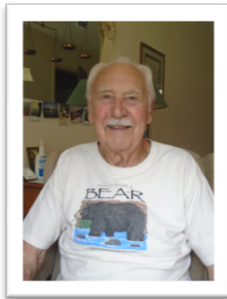
Featured Resident of the Month